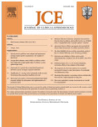
Journal of Clinical Epidemiology