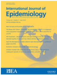
International Journal of Epidemiology