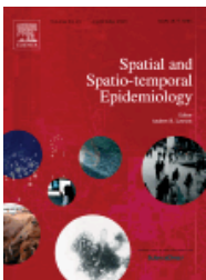
Spatial and Spatio-temporal Epidemiology