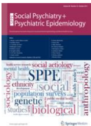
Social Psychiatry and Psychiatric Epidemiology