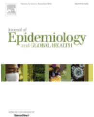
Journal of Epidemiology and Global Health