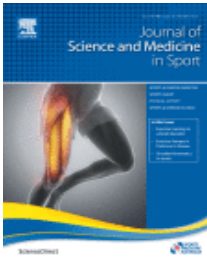
Journal of Science and Medicine in Sport