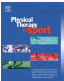
Physical Therapy in Sport