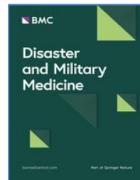
Disaster and Military Medicine