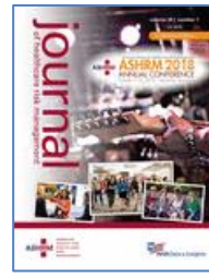
Journal of Healthcare Risk Management