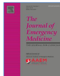
The Journal of Emergency Medicine