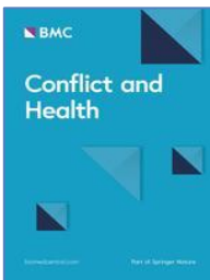
Conflict and Health