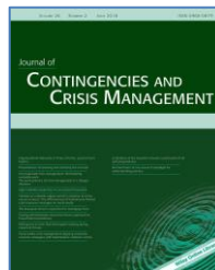
Journal of Contingencies and Crisis Management