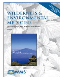
Wilderness & Environmental Medicine