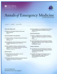
Annals of Emergency Medicine