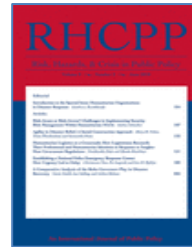
Risk, Hazards & Crisis in Public Policy