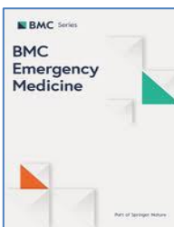
BMC Emergency Medicine