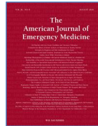
The American Journal of Emergency Medicine