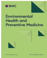
Environmental Health and Preventive Medicine