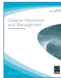
Disaster Prevention and Management: an International Journal