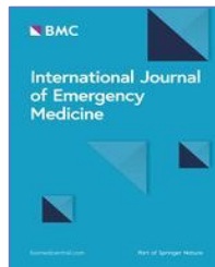
International Journal of Emergency Medicine